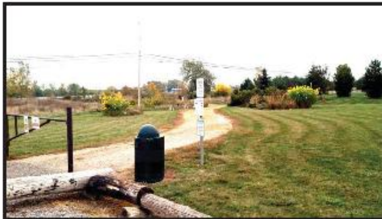
Frankenlust Township Nature Park.