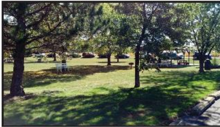
Frankenlust Township Play Park.